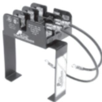
Primary Fuse Kit with Snap-on Secondary Fuse Block