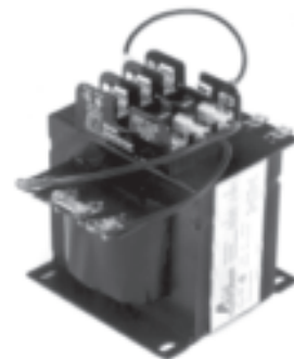
Integrally Mounted Fuse Blocks