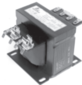
Secondary Fuse Clips